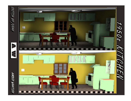
The top and bottom picture show the same kitchen. Do you see a difference in the lighting of the two pictures?

While she was onstage performing in plays, Amber loved the twinkling lights. She soon learned that there were people backstage controlling the lights. Amber decided that designing with light was the job for her!